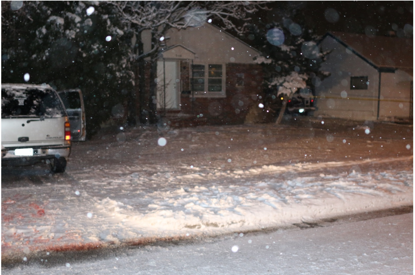
Photo taken of from 500 block of North Oliver looking East, Southeast. Residence of Witness 5 and Witness 6 is visible south of the Chevy Tahoe.