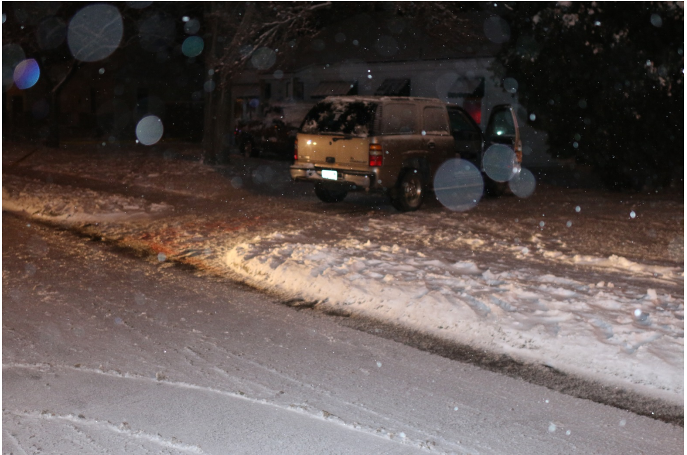
Photo taken from 500 block of North Oliver facing North, Northeast where Witness 2 and Witness 3 lived. Chevy Tahoe driven to scene by Witness 1 is parked in the driveway.