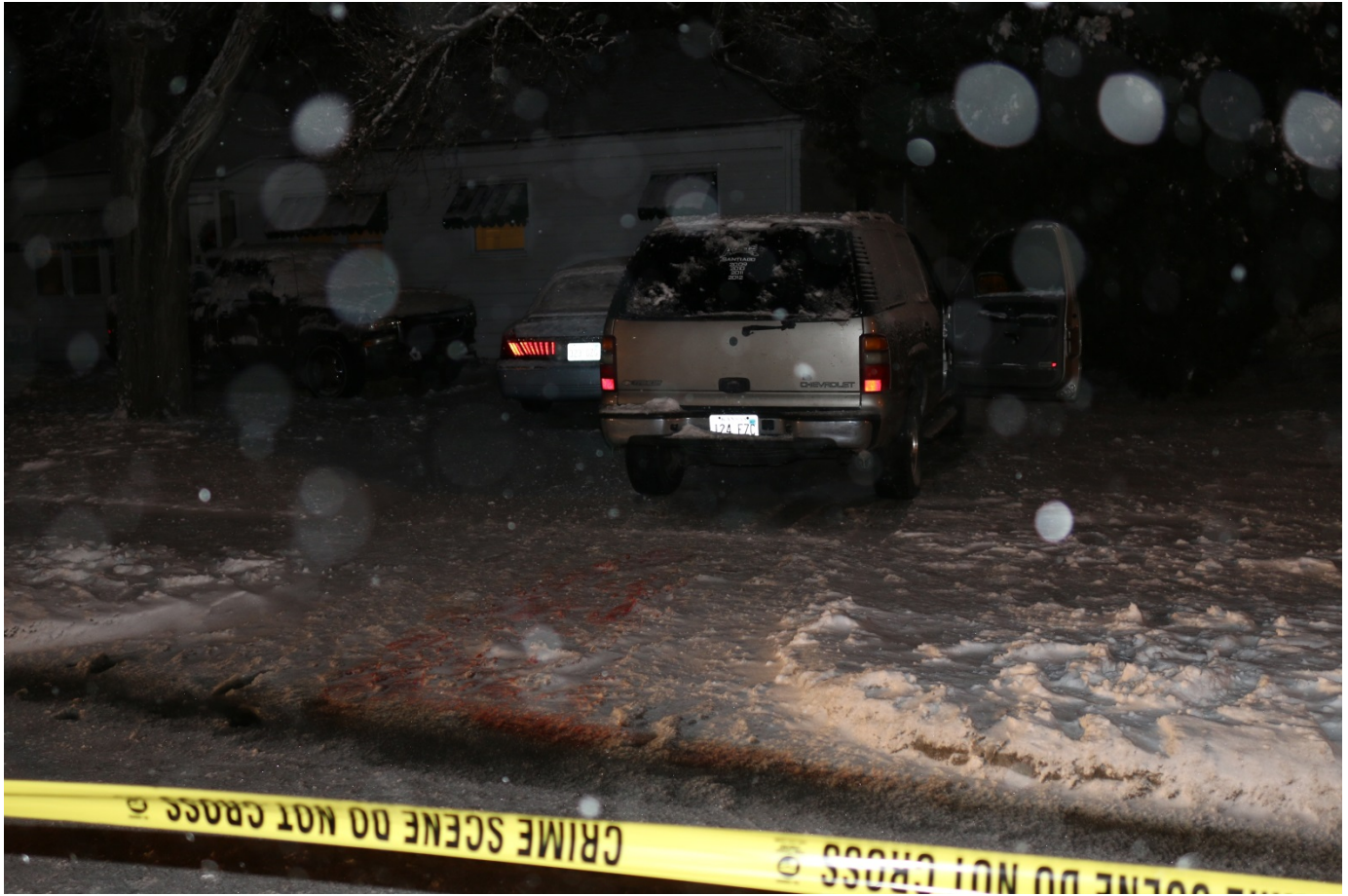
View from 500 block of North Oliver, looking East. Chevy Tahoe in the driveway facing East with passenger door open.