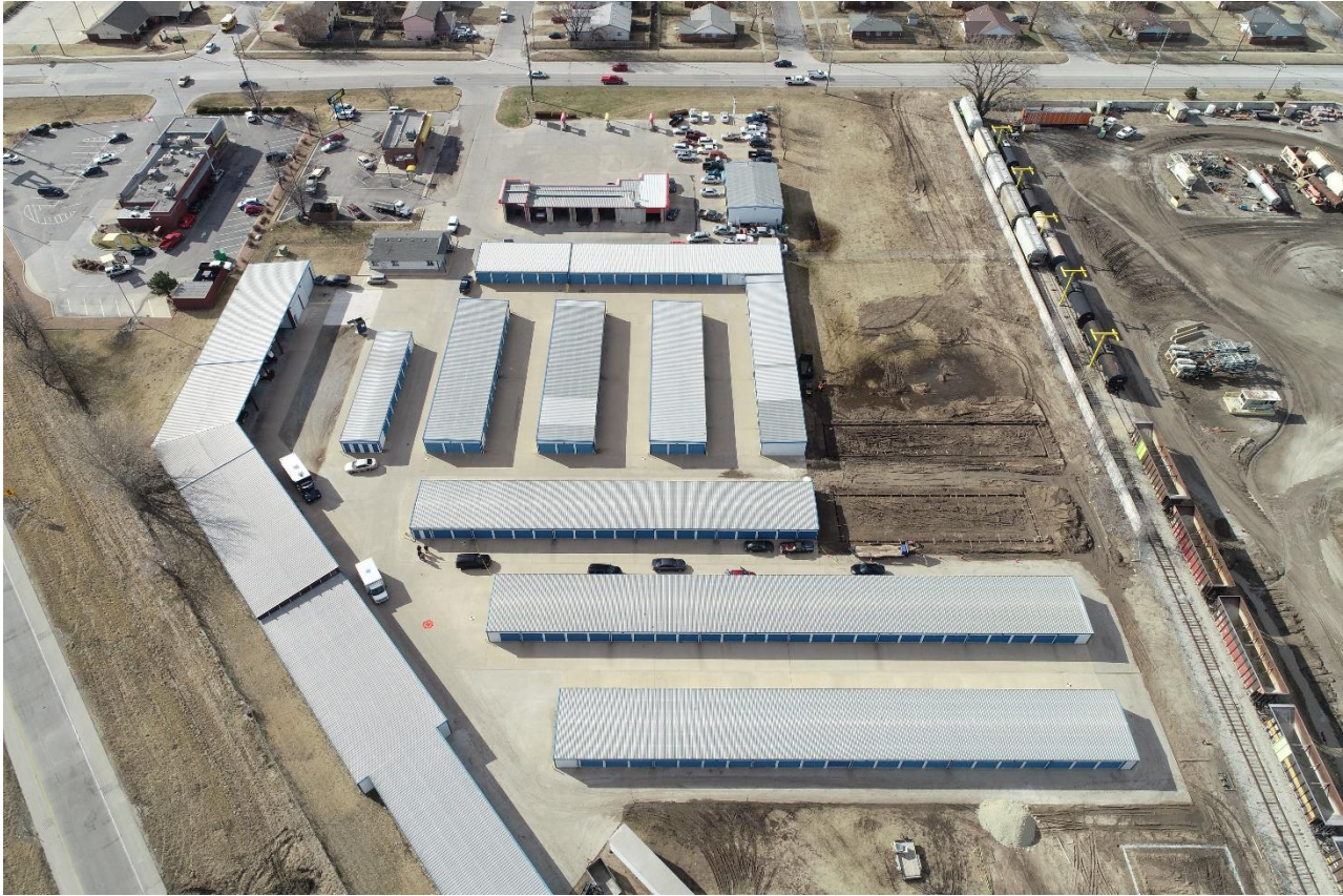
Storage facility – overhead view