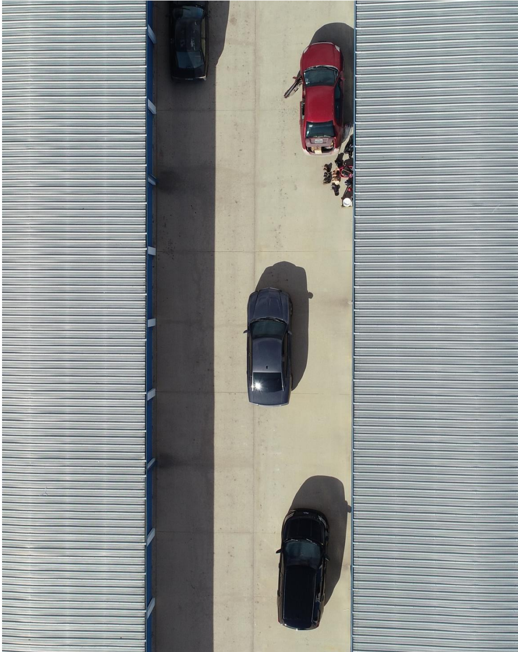
Overhead view. Mr. Bosiljevac's maroon car, Deputy 1's patrol vehicle and Deputy 2's patrol vehicle.