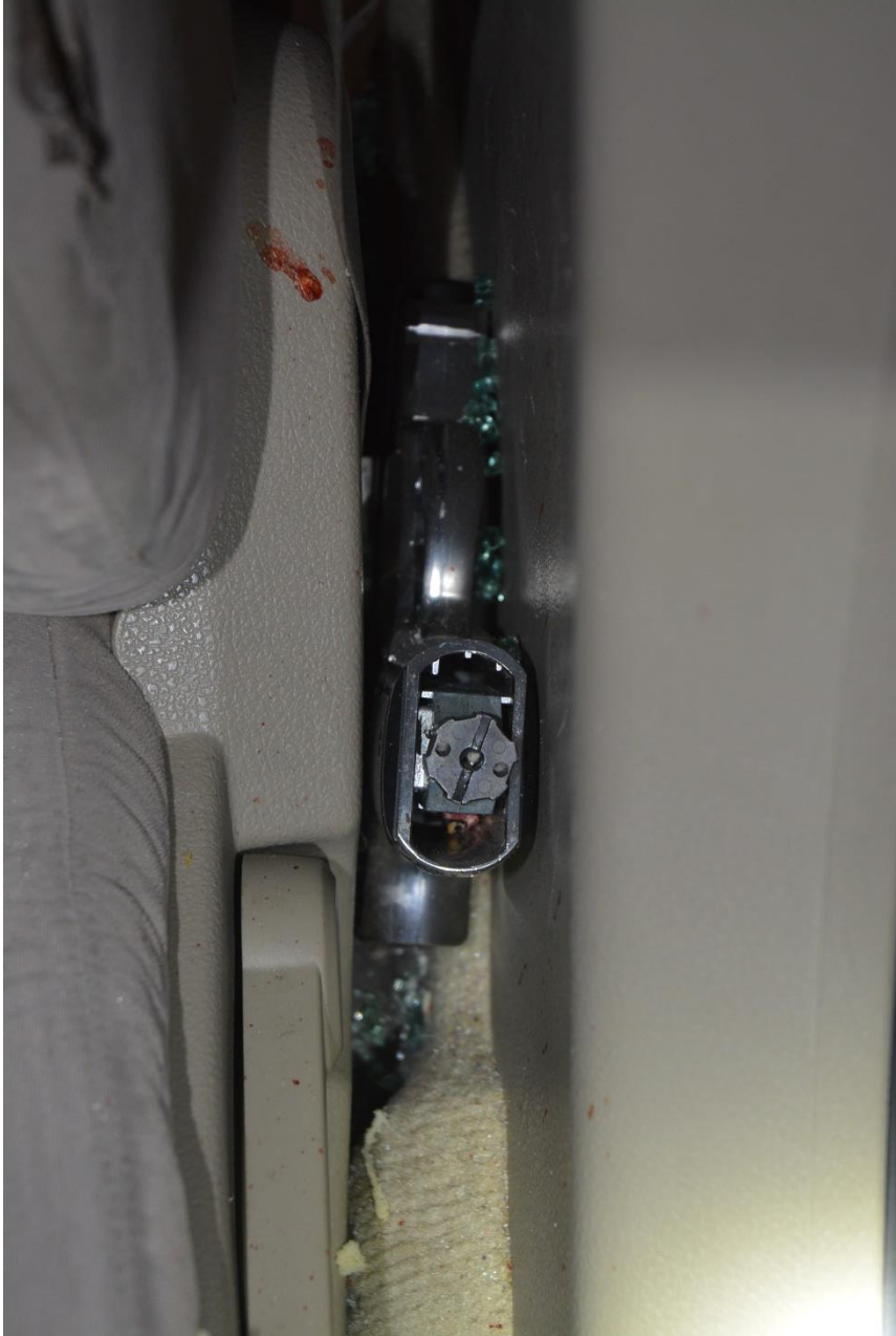
The air gun between Mr. Bosiljevac's seat and the interior wall of the car, as located by crime scene investigators.