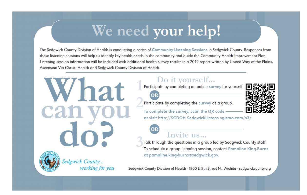
Appendix 3: Postcards used to advertise CLS