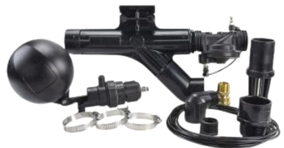
Table 603.2 has a listing of hazards and environments that can help you to select the correct backflow prevention device for your application.

Please contact a plumbing inspector if you have questions about a particular location and device.