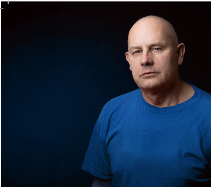
Sedgwick County Department of Corrections PREA Coordinator 316-660-1649