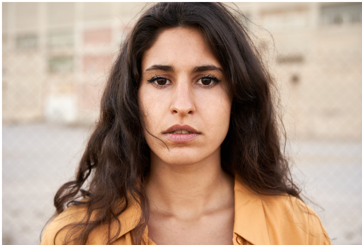
Kansas Protection Report Center 1-800-922-5330