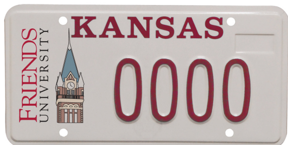
Artist rendering. Actual license plate may differ.

Show your Falcon pride with the official Friends University license plate! Annual fees received from official license plates will benefit Friends University scholarships.