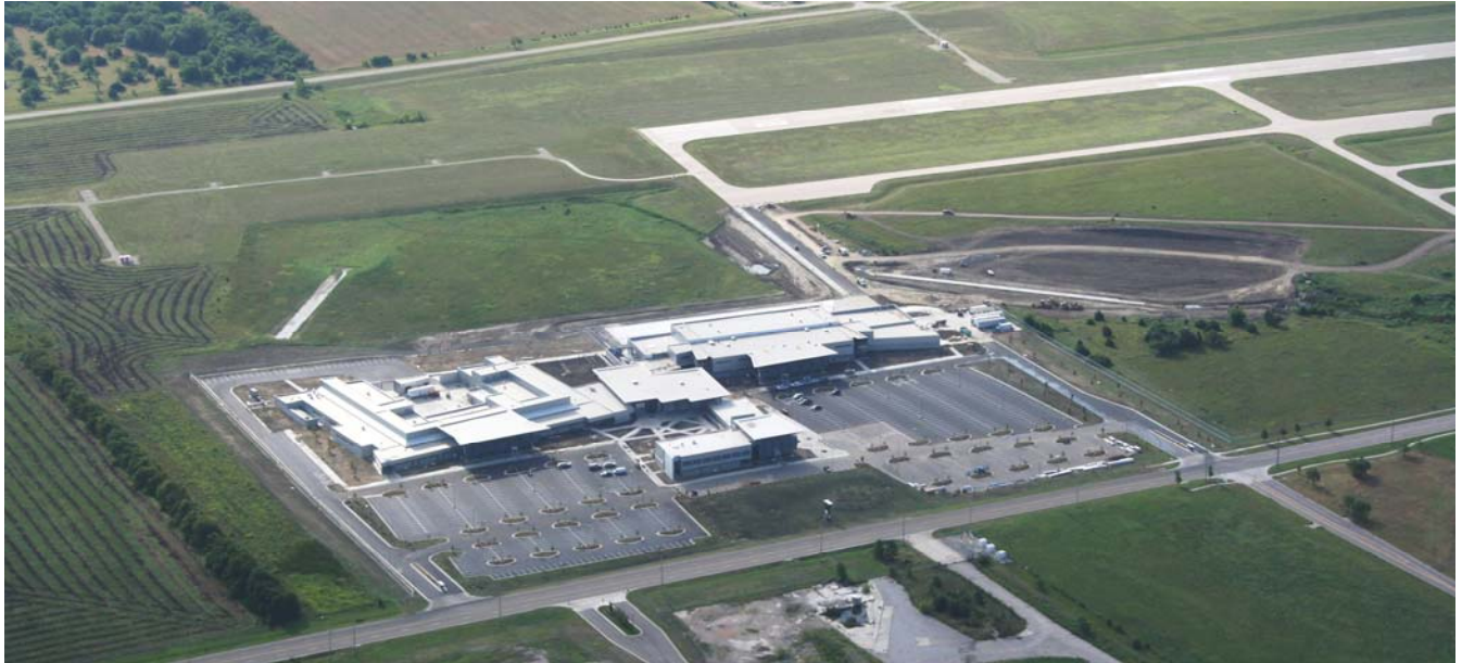
The National Center for Aviation Training