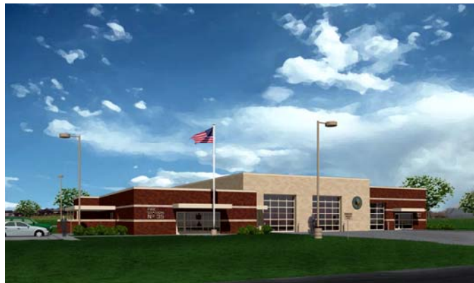
Fire District Relocation Plan - Fire Station 32 Wild West Drive; Fire Station 33, Maize; Fire Station 35 (above), Goddard; Station 36, southeast Sedgwick County; Fire Station 39, southwest Sedgwick County