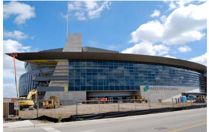
The INTRUST Bank Arena (above)

Major projects scheduled for completion in 2010 or currently in progress include: