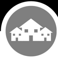
Urban & Regional Development