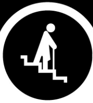
Elderly & Aging