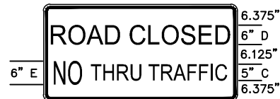
SIGN LAYOUT FOR R11-4SP