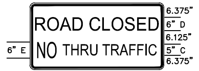
SIGN LAYOUT FOR R11-4SP