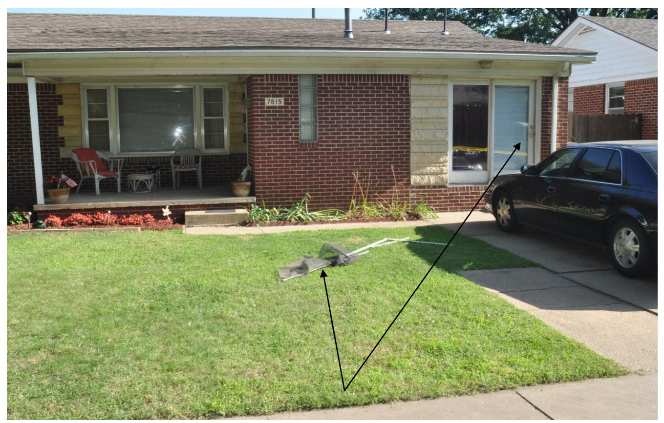
Torn screen and frame from front door of 7815 E. Clay