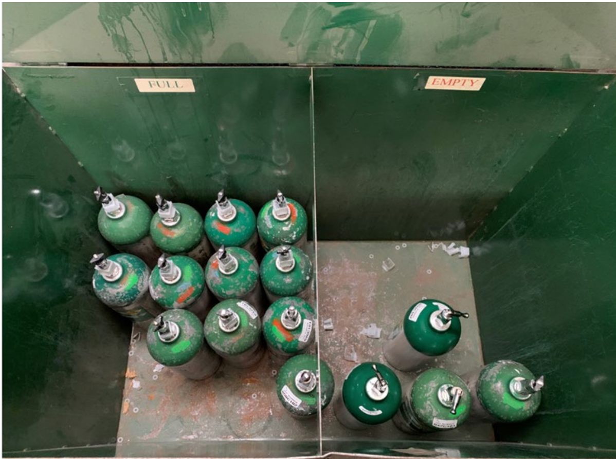
Via Christi St. Francis "M: Cylinder Storage