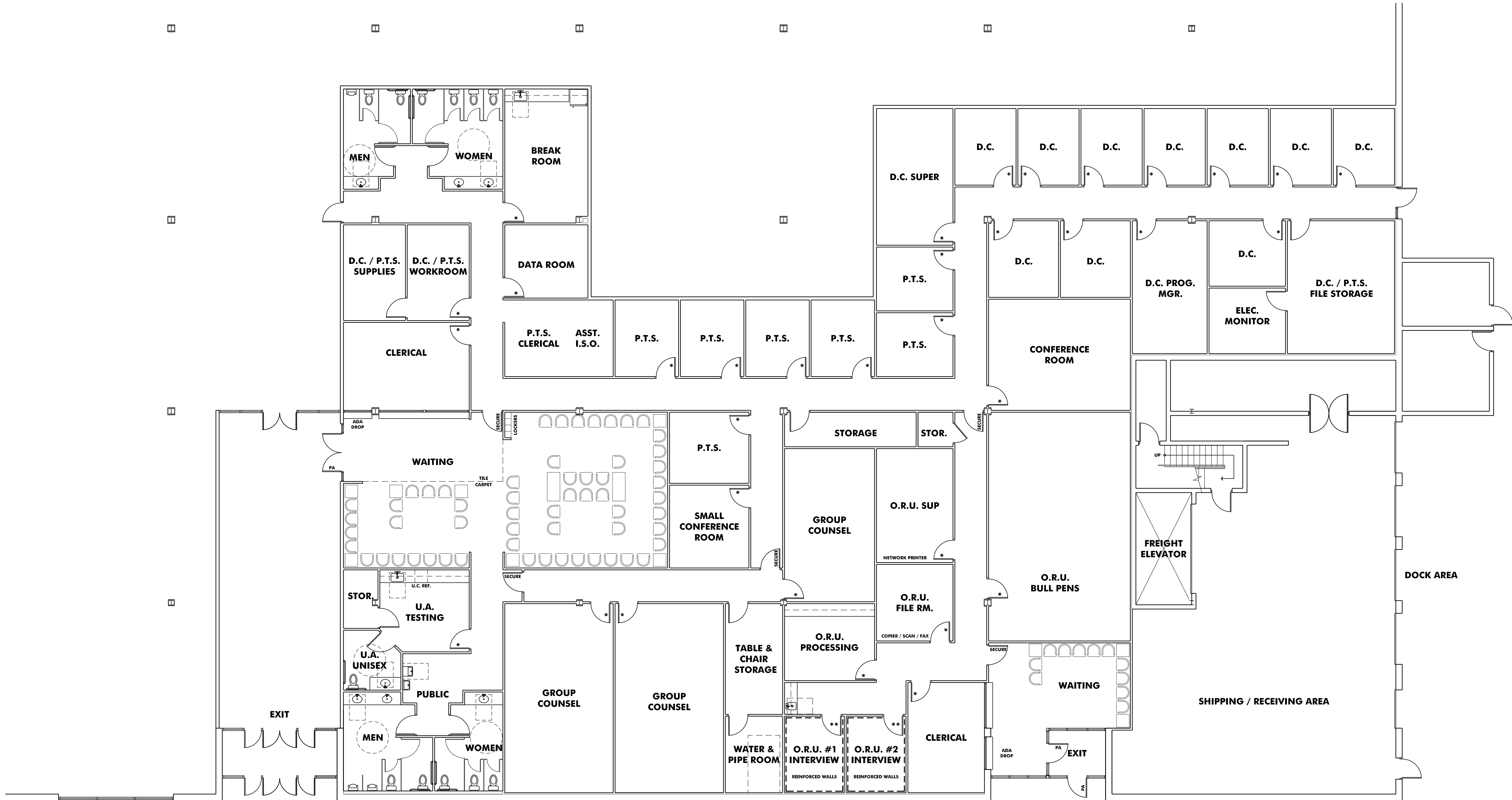
A FIRST FLOOR PLAN 13,814 SQFT 1/8" = 1'-0" * DOOR WITH VIEW PANEL ** METAL DOOR WITH VIEW PANEL AND DOOR LATCH ON OUTSIDE OF DOOR PA POWER ASSIST

KREHBIEL ARCHITECTURE 1300 E. Lewis Wichita KS 67211 316.267.8233 316.267.8566 fax krehbielarchitecture.com