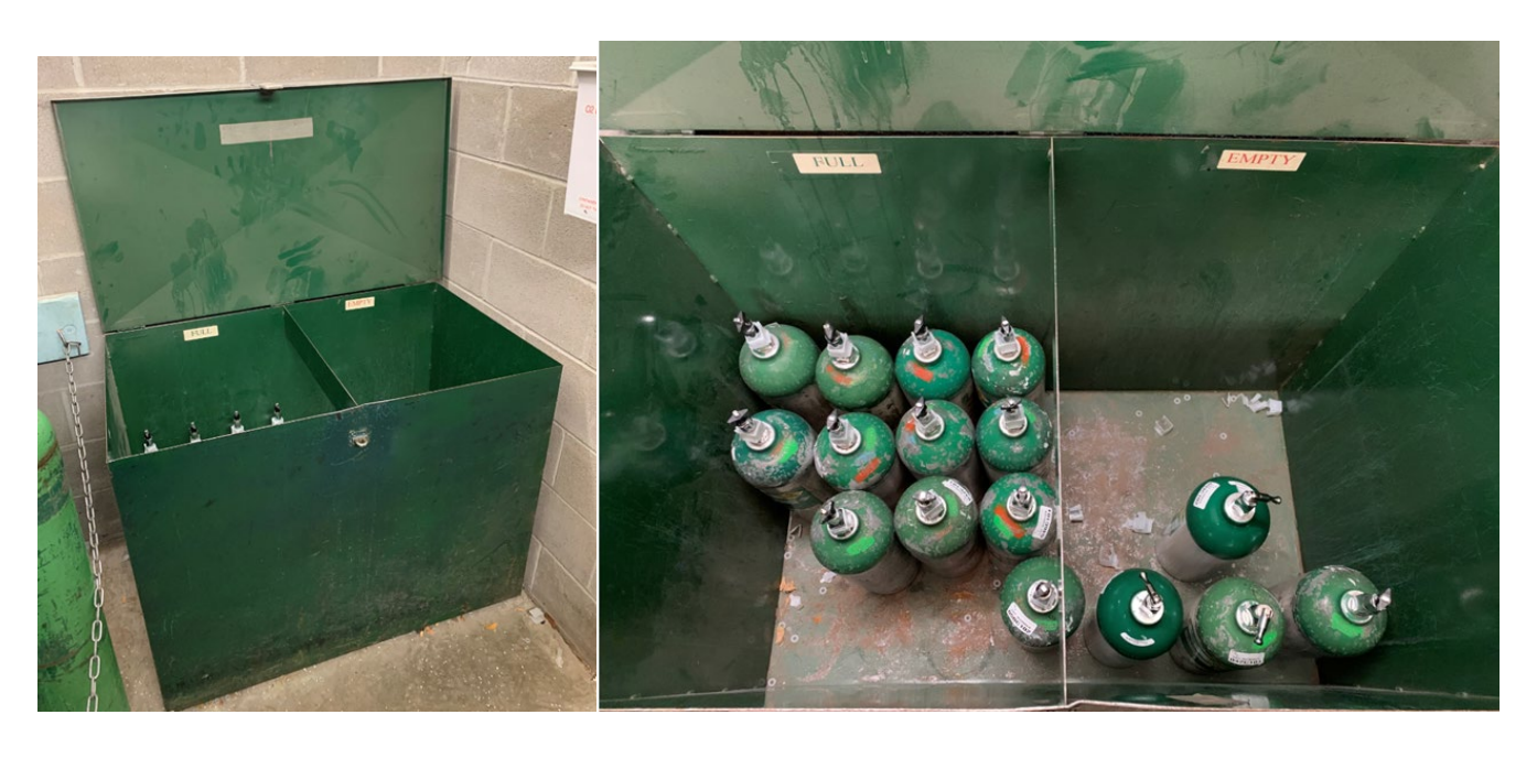
Via Christi St. Francis "M: Cylinder Storage