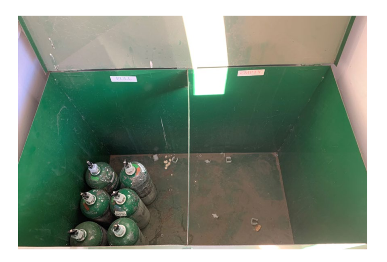
Via Christi St. Joseph "M: Cylinder Storage