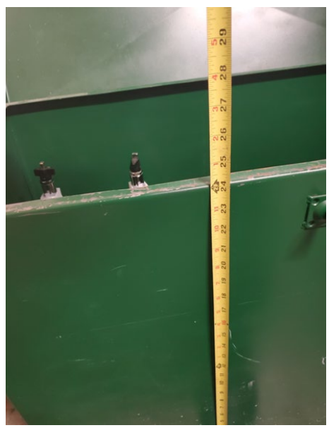
RFB #23-0060 Sedgwick County....Working for You