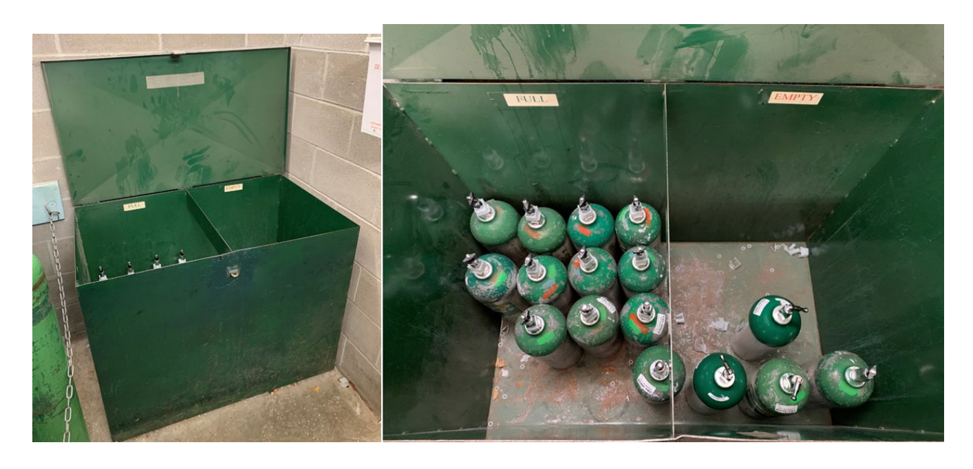
Via Christi St. Francis "M: Cylinder Storage