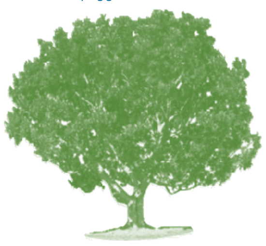
Clean Water. Healthy Life.

Stream corridors should be buffered with trees and native plants – not used as dumping grounds