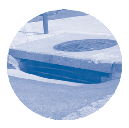
Clean Water. Healthy Life.