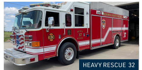
HEAVY RESCUE 32