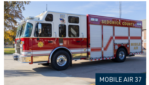
MOBILE AIR 37