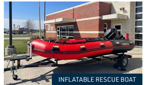
INFLATABLE RESCUE BOAT