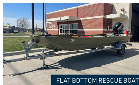
FLAT BOTTOM RESCUE BOAT