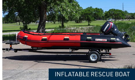
INFLATABLE RESCUE BOAT